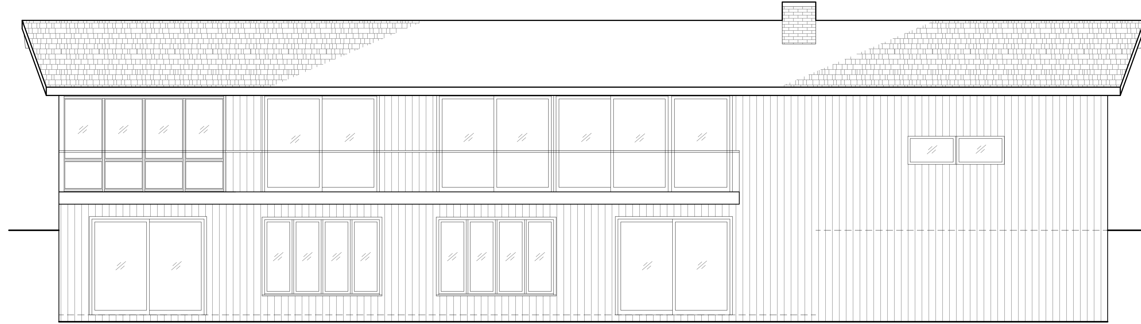
Existing Exterior Elevation, East