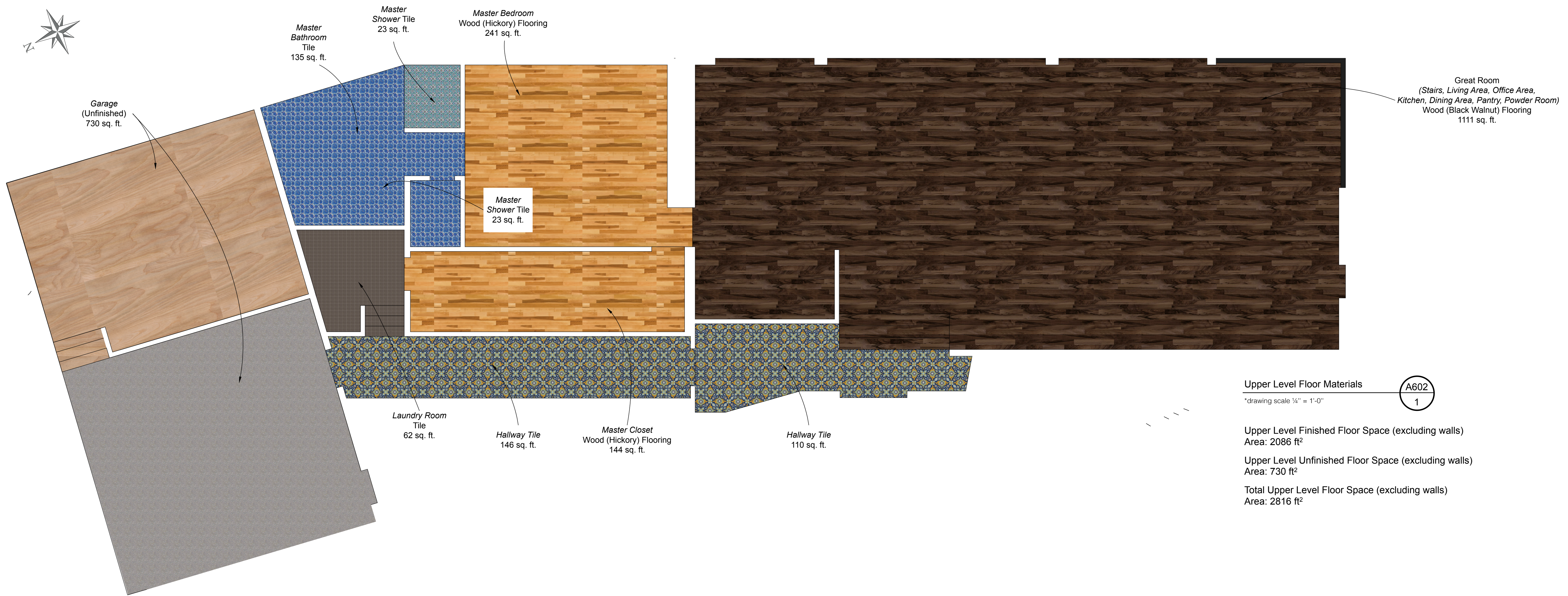
Upper Level Floor Materials A602 1 *drawing scale 1/4" = 1'-0"

Upper Level Finished Floor Space (excluding walls) Area: 2086 ft 2 Upper Level Unfinished Floor Space (excluding walls) Area: 730 ft 2 Total Upper Level Floor Space (excluding walls) Area: 2816 ft 2